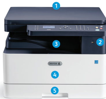
Xerox® B1022 Multifunction Printer

9 The Xerox® B1025 features a larger 4.3-inch colour touchscreen interface for added simplicity.