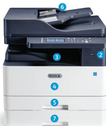
Xerox® B1025 Multifunction Printer

DADF configuration shown with optional additional tray.