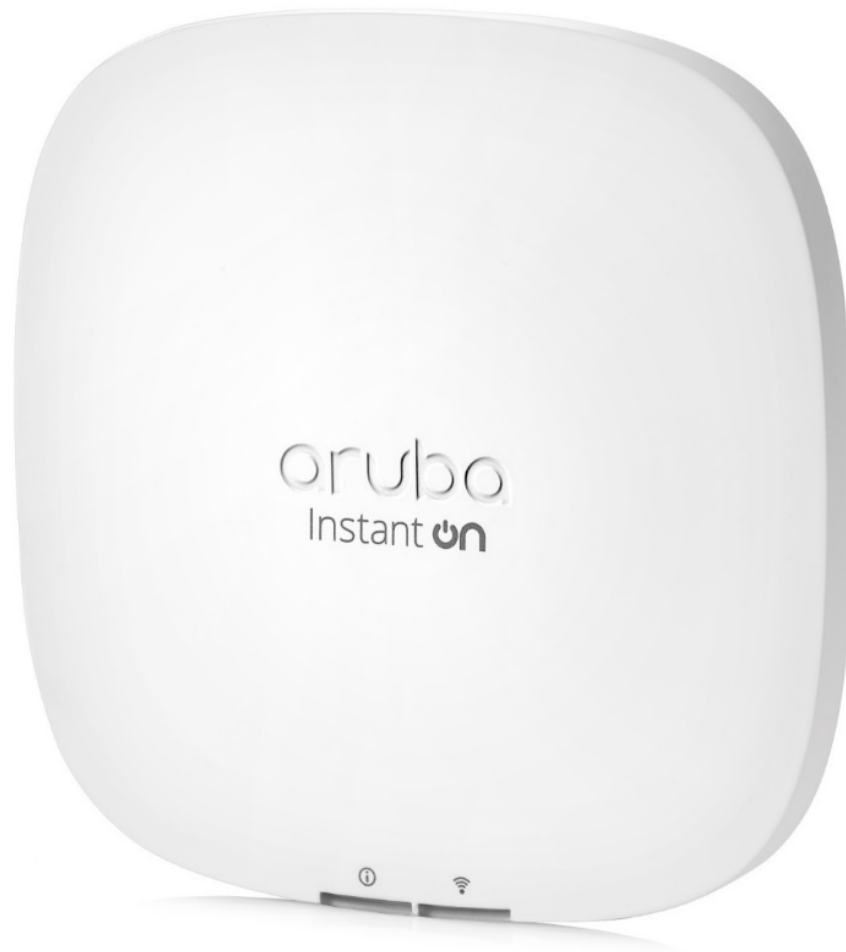
Aruba Instant On AP22 Indoor Access Points