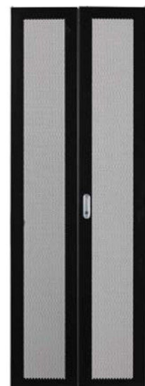
Dual Perforated Door