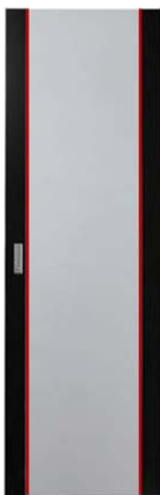
Glass Front Door