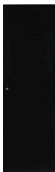
Metallic Rear Door