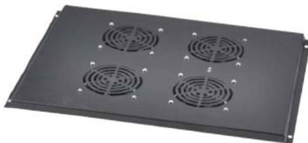
Fan Unit including 4 fans

Premium-Line Systems GmbH, Rosenheimer Str.89, D-83064 Raubling, Germany