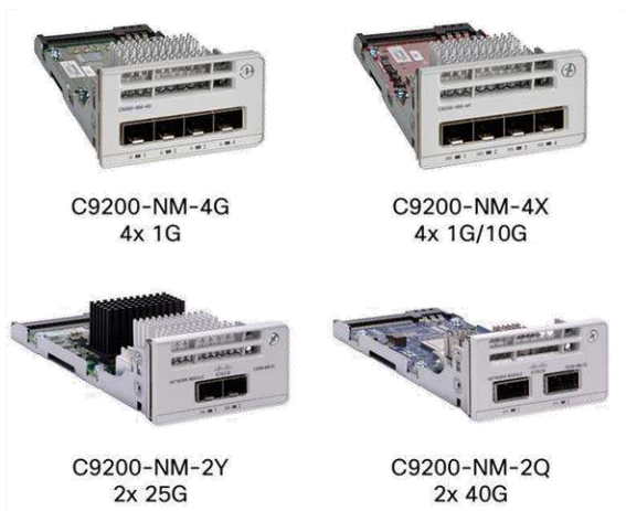
Figure 2. Cisco Catalyst 9200 Series Switch network modules

Cisco Catalyst 9200 Series switches come with modular or fixed uplinks as indicated in Table 1. With modular SKUs, the field-replaceable network modules provide infrastructure investment protection by allowing a nondisruptive migration from 1G to 10G and beyond. When you purchase the switch, you can choose from the network modules described in Table 3.