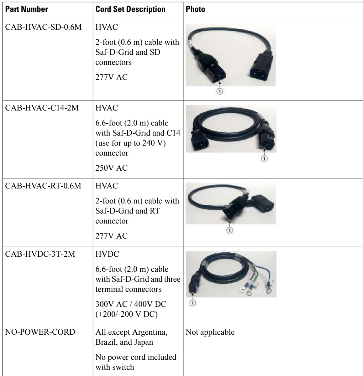
Table 1: HVAC/HVDC Power Cables Callout Table