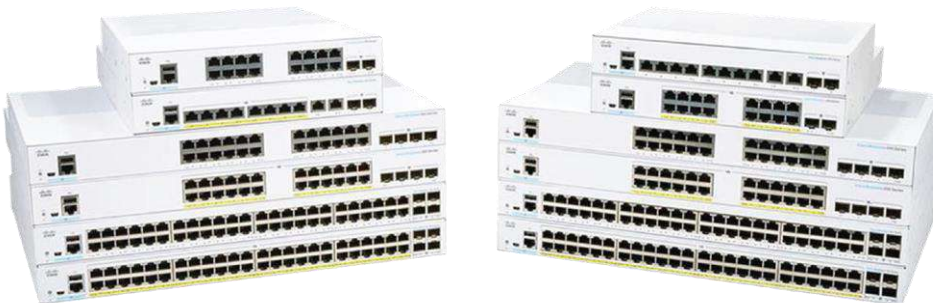
Figure 2. Cisco Business 250 series smart switches

The Cisco Business 250 Series is the next generation of affordable smart switches that combine powerful performance and reliability with a complete suite of the features you need for a solid business network. These switches provide flexible management options, comprehensive security capabilities and Layer 3 static routing features far beyond those of an unmanaged or consumer-grade switch, at a lower cost than for fully managed switches. When you need a reliable solution to share online resources and connect computers, phones, and wireless access points, Cisco Business 250 Series Smart Switches provide the ideal solution at an affordable pricing point.