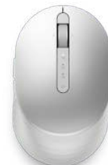
Dell Premier Rechargeable Wireless Mouse - MS7421W

Compact and portable 7-in-1 USB-C mobile adapter provides superb video, data connectivity and up to 90W power pass-through to your PC.