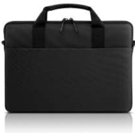
Dell EcoLoop Pro Sleeve (L) - CV5623 (15" models)

Eco-friendly and dependable sleeve to keep your laptop securely protected on the go.