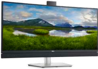
34" Curved Video Conferencing Monitor - C3422WE

Bring your meetings to life on this 34-inch curved WQHD monitor with an integrated IR camera, dual 5W speakers and a dedicated, one-touch Teams button.