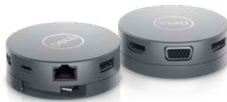
Dell USB-C Mobile Adapter - DA310

Travel light while making a positive impact on the environment by selecting the compact, eco-friendly Dell Premier Slim Backpack 15 (PE1520PS) with EVA foam cushioning to protect your laptop from impact.