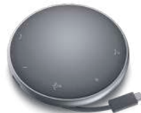
Dell Speakerphone with Multiport Adapter

Experience dual-screen productivity anywhere with Dell's first-ever 14" portable monitor.