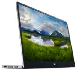
14" Portable Monitor - C1422H

Multi-task seamlessly across 3 devices with this premium full-size keyboard and sculpted mouse combo featuring programmable shortcuts and 36 months battery life. 42