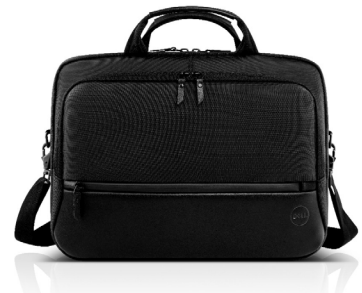
Dell Premier Briefcase 15 - PE1520C

Eco-friendly and dependable sleeve to keep your laptop securely protected on the go.