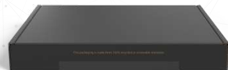
New 100% recycled or renewable packaging 41 Easy to open, uses less carbon to ship.

Most innovative use of bio-based & recycled materials in 14" and 15" premium commercial laptops , in specific parts with up to 39% in bottom bumpers, up to 50% recycled plastic in the battery frame, up to 35% in the palm rest and up to 18% recycled carbon fiber in select lids 18 .