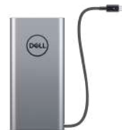
Notebook Power Bank Plus – USB C, 65Wh - PW7018LC

Multiport adapter with integrated speakerphone offers an all-in-one connectivity and conferencing solution.