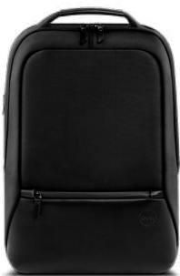
Dell Premier Slim Backpack 15 - PE1520PS

Active Pen with a Tile location tracker providing long battery life on a single charge.