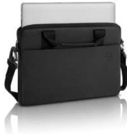
Dell EcoLoop Pro Sleeve (S) - CV5423 (13/14" models)

Eco-friendly and dependable sleeve to keep your laptop securely protected on the go.