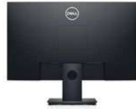
Back view - Cable management slot

Easily adjust the panel to your preferred viewing position.