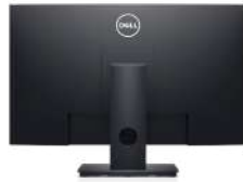
Back view - Cable management slot

Easily adjust the panel to your preferred viewing position.