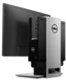
OptiPlex Small Form Factor All-in-One Stand – OSS21

Create a clean workspace for your Small Form Factor with integrated cable management and full range monitor adjustability.