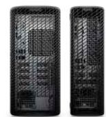
OptiPlex Tower, Small Form Factor Cable Covers

Experience crystal-clear conference-calls with the world's most intelligent Microsoft Teams-certified speakerphone. 19