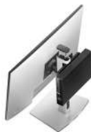
OptiPlex Micro All-in-One Stand - MFS22

Create a clean workspace for your Small Form Factor with integrated cable management and full range monitor adjustability.