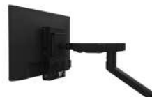
OptiPlex Micro Dual VESA Mount with Adapter Bracket

Adjustable, compact stand for your micro creates a clean, open workspace with minimal cables.