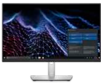
Dell UltraSharp 24 Monitor - U2422H

Elevate your productivity on this 24" FHD monitor with brilliant color coverage and ComfortView Plus, an always on built-in low blue light screen.