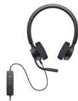
Dell Pro Stereo Headset – WH3022

Enhance your everyday productivity with a quiet full size keyboard and mouse combo that offers programmable shortcuts and 36 months battery life. 18