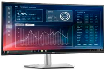
Dell UltraSharp 34 Curved USB-C Hub Monitor - U3421WE

Get immersive productivity on a 34" WQHD curved monitor with a wide color coverage and extensive connectivity including RJ45, USB-C and quick-access front ports.