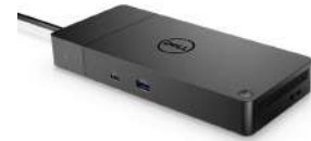
Dell Thunderbolt 4 Dock - WD22TB4

Work from anywhere with this Bluetooth Teams certified headset that lets you switch seamlessly to your PC or smartphone and enjoy crystal clear audio on the go.