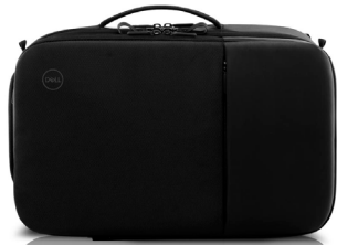
Dell Pro Hybrid Briefcase Backpack 15 - PO1521HB

Boost your PC's power on the world's first modular Thunderbolt 4 dock with a future-ready design