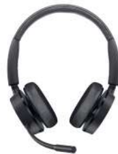
Dell Pro Wireless Headset - WL5022

Get immersive productivity on a 34" WQHD curved monitor with a wide color coverage and extensive connectivity including RJ45, USB-C and quick-access front ports.