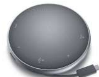
Dell Mobile Adapter Speakerphone - MH3021P

Get productive with a quiet, full-size keyboard and mouse combo with programmable shortcuts and 36 months battery life.