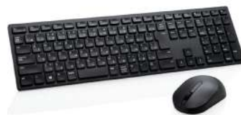
Dell Pro Wireless Keyboard and Mouse - KM5221W

Protect your laptop from impact with this earth friendly backpack that is lined with EVA foam cushioning. Easily convert from backpack to briefcase mode and travel with ease.