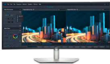
Dell UltraSharp 34 Curved USB-C HUB Monitor - U3421WE

An immersive 34" WQHD curved monitor with wide color coverage and extensive connectivity including RJ45, USB-C® and quick-access front ports.