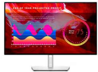
Dell UltraSharp 27 Monitor - U2722D

World's slimmest and lightest soundbar offers exceptional audio clarity and easy magnetic attachment to your Dell monitors, ensuring a clutter-free desk.