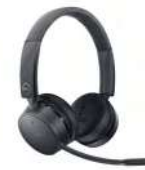
Dell Pro Wireless Headset - WL5022

Elevate your video conferencing experience with this high quality 4K webcam that optimizes your visuals with a large 4K Sony STARVIS™ CMOS sensor and AI Auto-Framing.