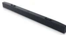
Dell Slim Soundbar - SB521A

An immersive 34" WQHD curved monitor with wide color coverage and extensive connectivity including RJ45, USB-C® and quick-access front ports.