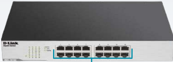
Sixteen 10/100/1000 Gigabit Ethernet Ports