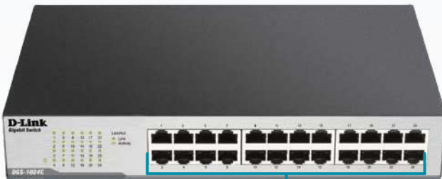
Twenty-four 10/100/1000 Gigabit Ethernet Ports