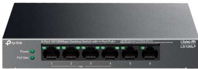
4 × 10/100 Mbps RJ45 ports with PoE+ 2 × 10/100 Mbps RJ45 ports