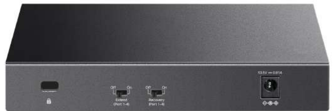
Button for Extend Mode Button for PoE Auto Recovery