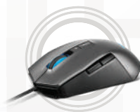
Lenovo IdeaPad Gaming M100 RGB Mouse