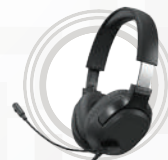
Lenovo IdeaPad Gaming H100 Headset