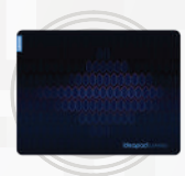
Lenovo IdeaPad Gaming Cloth Mousepad (M & L)*

* Final product may vary slightly from image.