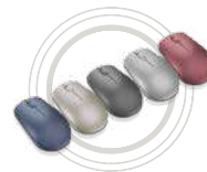
Lenovo 530 Wireless Mouse