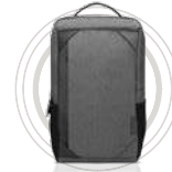
Lenovo 15.6" Laptop Urban Backpack B530