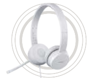
Lenovo 110 USB Stereo Headset