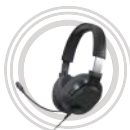
Lenovo Ideapad Gaming H100 Headset