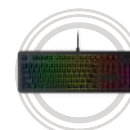
Legion K310 RGB Gaming keyboard