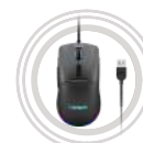
Lenovo M210 RGB Gaming Mouse