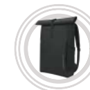
Lenovo IdeaPad Gaming Modern Backpack