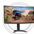
Legion Y27h-30 Monitor