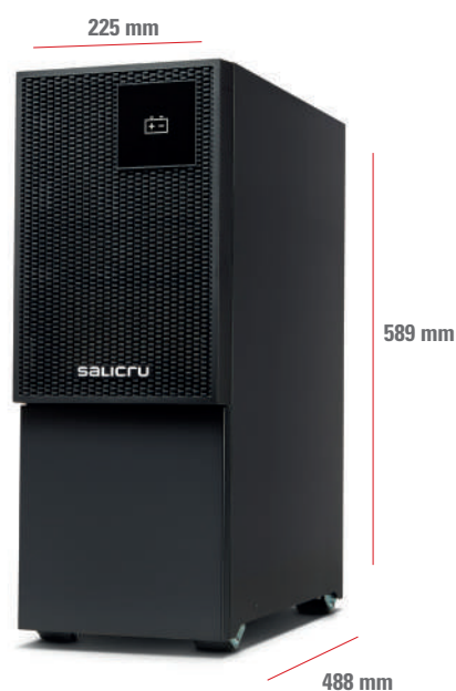
EBM - SLC TWIN PRO3