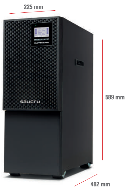
SLC 4000÷10000 TWIN PRO3